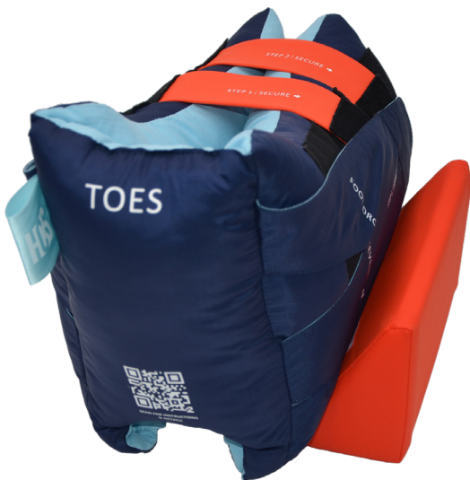
Closed Foot Heel Protector