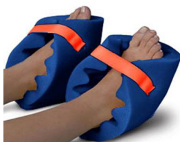
#82200 Protector Heel Convoluted Foam