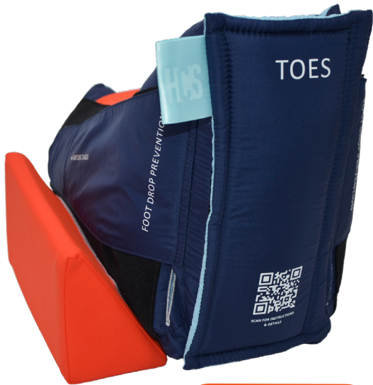
Open Foot Premium Heel Protector